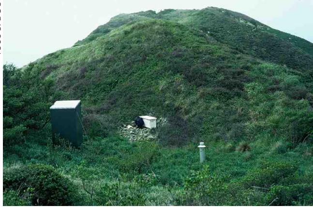
The Stephens Island frog bank in the 1980's.