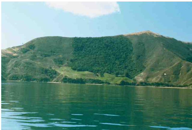
Frog Bush on Maud Island.