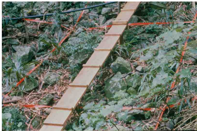
Boardwalk protecting fragile frog habitat on Stephens Island.

This webpage represents the views of the Endangered Species Foundation of New Zealand and not necessarily those of other individuals or organisations involved in the conservation of this species.