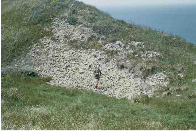
The original Stephens Island frog bank in the 1960's.